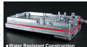
• Water Resistant Construction

Built to meet or exceed the requirements of the U.S. MIL-STD 810 C/D/E standards, the VX-160E is designed to survive under difficult operating conditions of shock, vibration, and driving rain. Cost-performance begins with durability, and the Mil-Spec toughness of the VX-160E is your guarantee of its design quality.